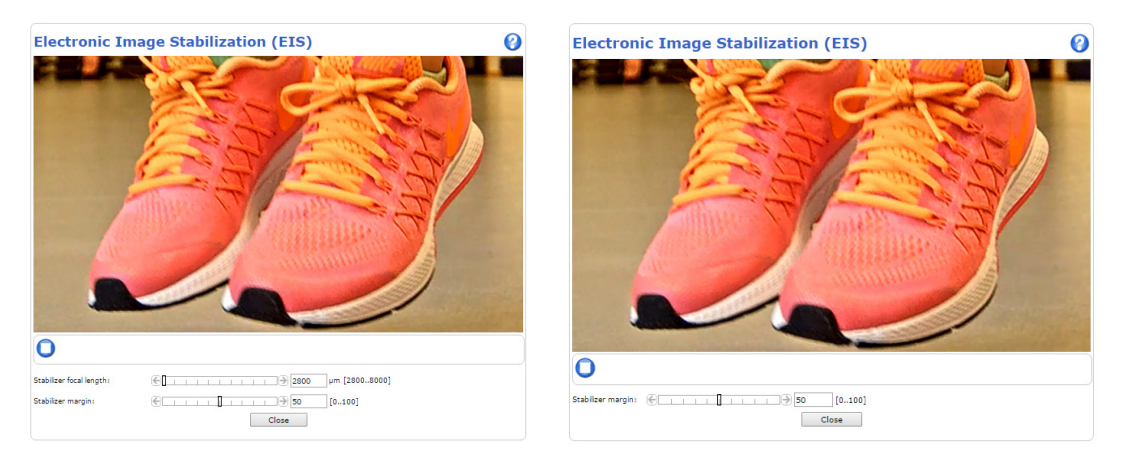
Figure 3: Camera without (left) and with (right) i-CS lens.

See Section 8, Useful links, for more information on EIS.